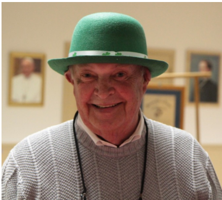
A Leprechaun For Sure