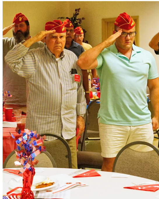
Will Turner showing the "Proper" way to salute. Perfect, just like your drill instructor taught you.