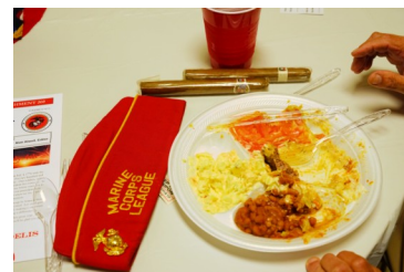
Basic Essentials of a Marine Food, Cover, Cigars