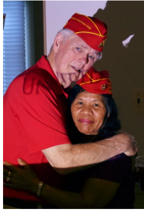
Lights, Action, Camera