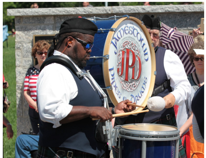
Some of the several thousand persons who gathered at the Carolina Field of Honor for the Memorial Day Service of Remembrance. Young and old alike showed up to honor the fallen heroes of every generation.