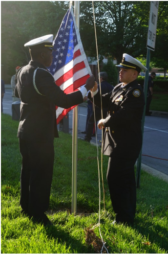
Southeast H.S. Color Guard