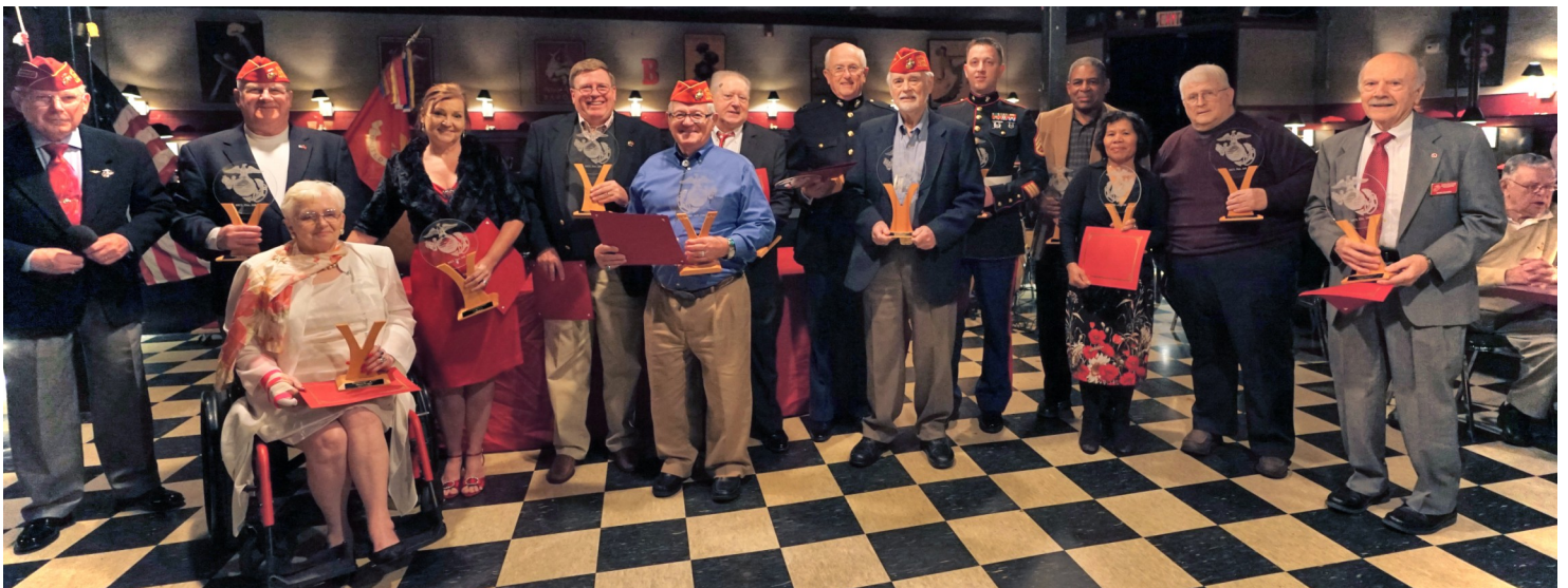
Recipients of the Commandant’s Award for Outstanding Service to the Detachment