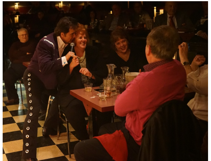
“Tom Jones” Singing Sweet Nothings