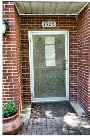
Entry doors that will be replaced with security doors.