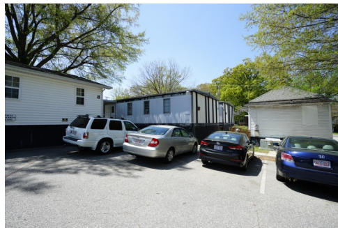
Several out buildings and parking at the Servant Center