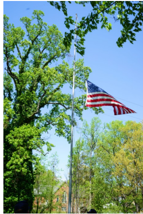
American Flag at the Servant Center