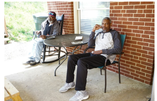
Veterans living at the center