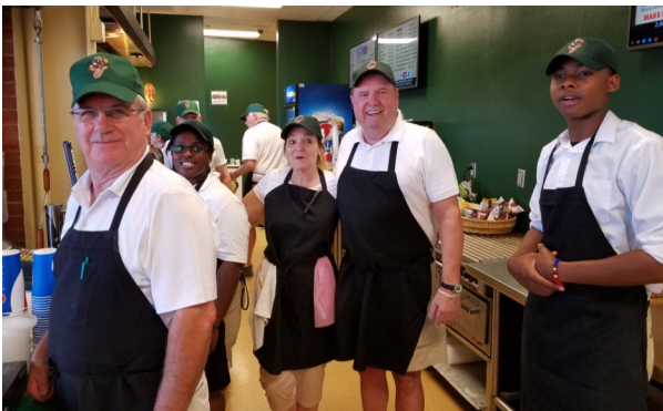
above: Tireless Workers below: Waiting for Game Time