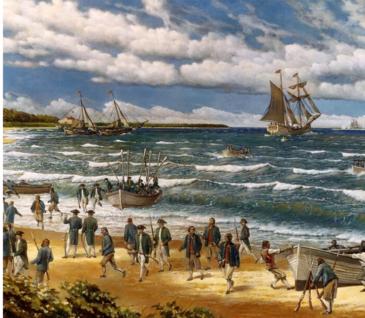
Battle of Nassau - 1776

The first amphibious raid was conducted just weeks after banding together. The Continental Marines successfully executed their first landing on a hostile shore. The British had been storing large supplies of gunpowder at Fort Nassau in the Bahamas for use against the 13 colonies. Captain Samuel Nicholas and 234 Marines sailed with the Navy on a mission to capture the supply. Within minutes of their arrival, the British troops surrendered. They acquired gunpowder, cannons and other military stores.