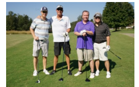
Grandover Resort and Spa