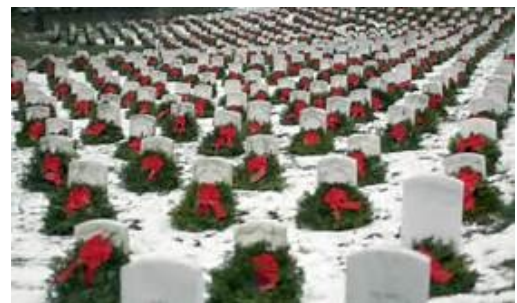
Wreaths Across America in December