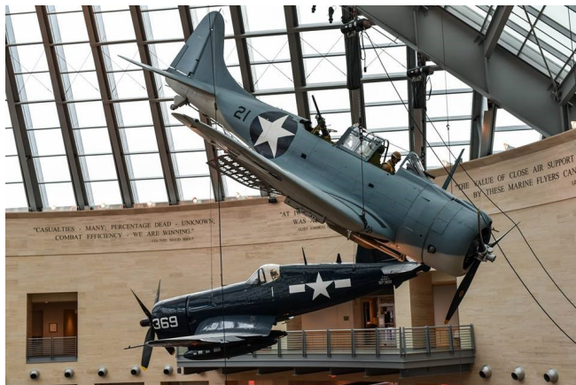
One of the Many Static Displays