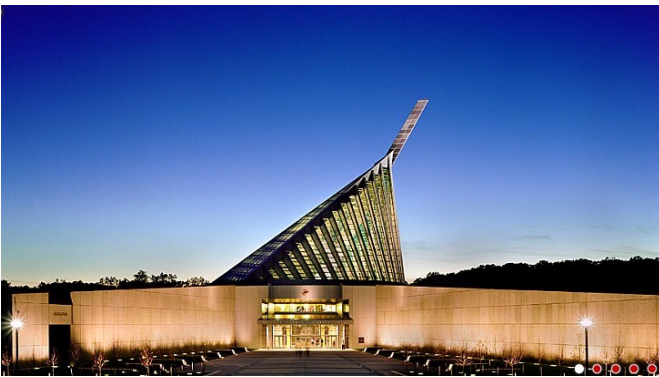
Exterior View of the Entrance

cation, and retention of Marines by informing and inspiring visitors through exhibitions and other public programs; by providing a backdrop for recruitment initiatives and an understanding of what it takes to “make a Marine”; by hosting classes for the Training and Education Command; and by providing opportunities for continuing education.