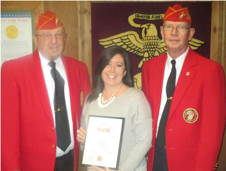
Stanly County Marine Corps League 1021 wants to thank everyone for helping their first Toys for Tots cam-