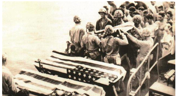
The burial at sea off Peleliu aboard the U.S.S. Pinkney, October 3, 1944.