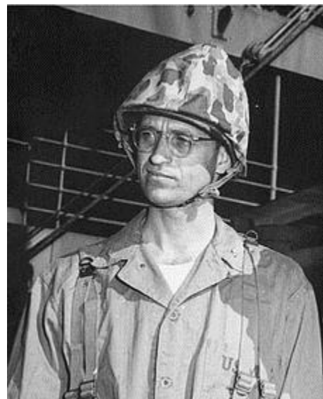
Roosevelt as a Marine Corps lieutenant colonel in World War II

(Editor's Note: Mrs Roosevelt had good reason to make this comment for her son, James, was a Marine.)